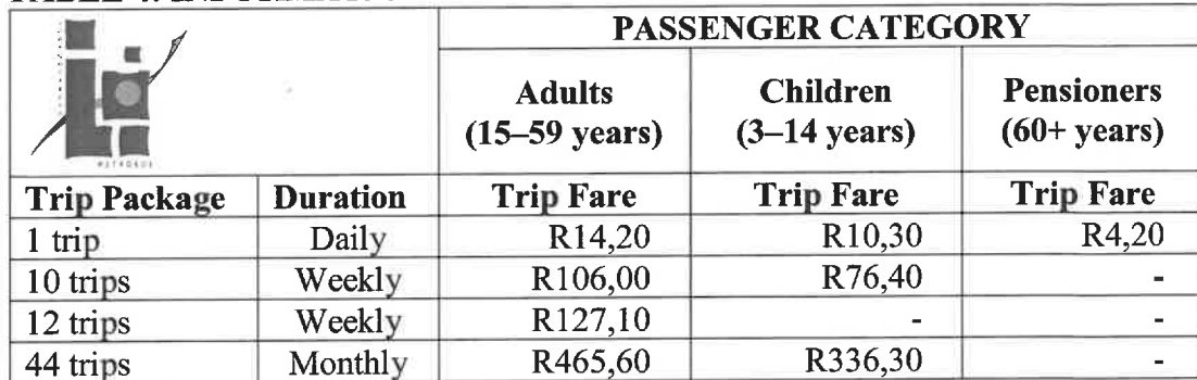
TABLE 4: INFORMATION ON THE METROBUS SERVICE

TABLE 4 below shows information on the Metrobus service in Johannesburg for three categories of passengers travelling by bus.